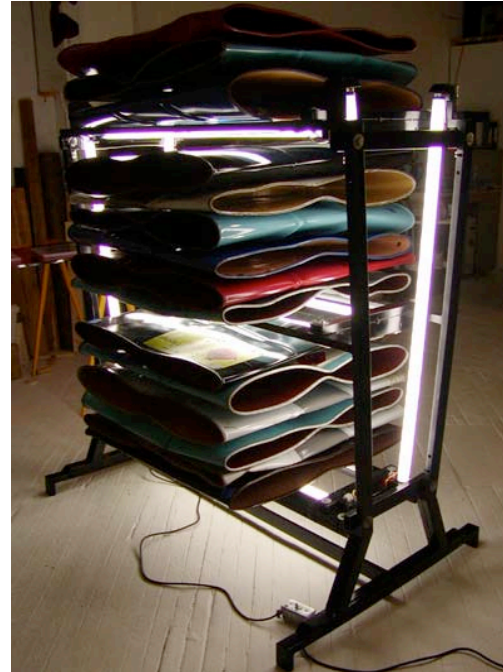
Pictured is Barrel a 1200 lbs sculpture composed of 15 smashed barrels, 4 transformers and 9 fluorescent tubes.

It is time that we reflect on what is really happening and reinvest into the infrastructure of America in energy development and education.