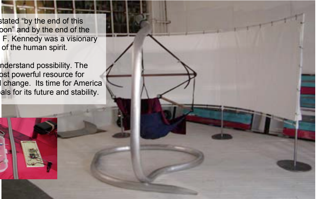
Pictured Passage2 in my studio 2004, the tree chair is suspended by 30 ft. bent aluminum tubing, surrounded by a flexible video screen. To the left is the accelerometer and microprocessor that alter the projected visuals.

It takes vision in order to understand possibility. The human spirit itself is the most powerful resource for knowledge, innovation and change. Its time for America set some new visionary goals for its future and stability.